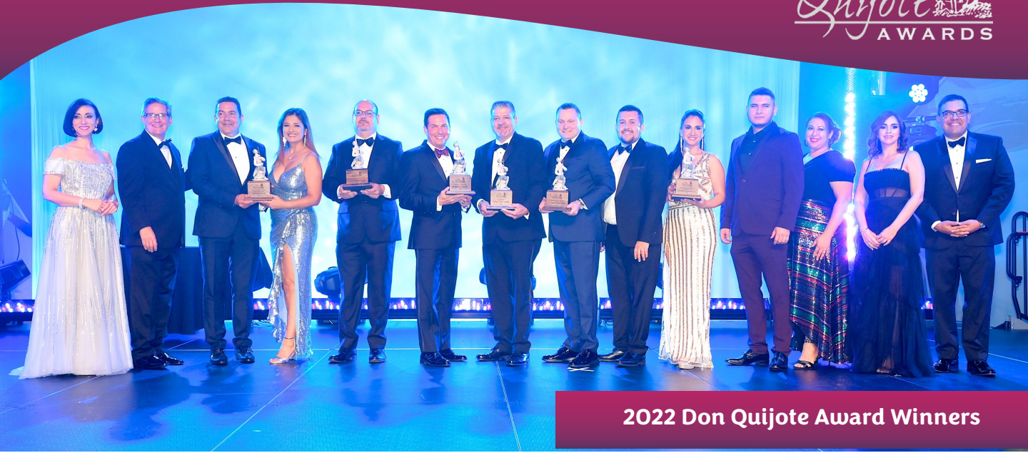
2022 Don Quijote Award Winners

The Don Quijote Awards Gala was conceived in 1997, by a group of visionaries from the Hispanic Chamber of Metro Orlando and Prospera .