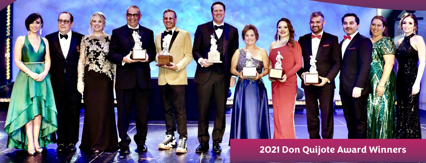
2021 Don Quijote Award Winners

The Don Quijote Awards Gala was conceived in 1997, by a group of visionaries from the Hispanic Chamber of Commerce of Metro Orlando (HCCMO) and Prospera .